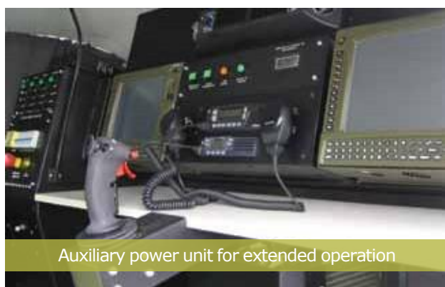
Auxiliary power unit for extended operation