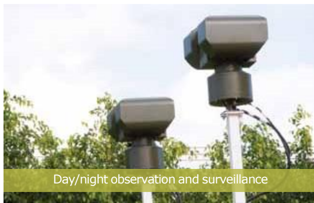
Day/night observation and surveillance