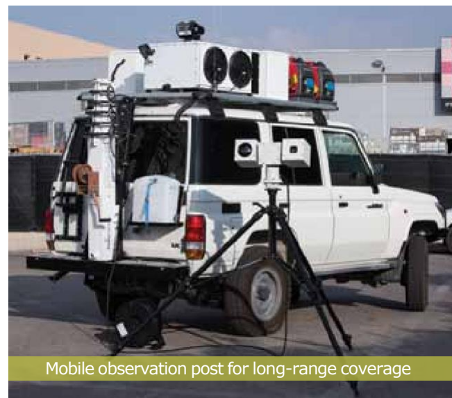
Mobile observation post for long-range coverage

Part of the YTS fleet of special operations vehicles, the Observation and Reconnaissance Vehicle harnesses 28 years of surveillance experience in real-life operational scenarios. The vehicle is suitable for a wide range of applications, including protecting borders, securing critical installations and infrastructures, escorting VIP security convoys, safeguarding large-scale public events, and providing reconnaissance for front-line units on a mission. YTS vehicles are in use by Israeli government and security agencies, and in other law enforcement agencies around the world.