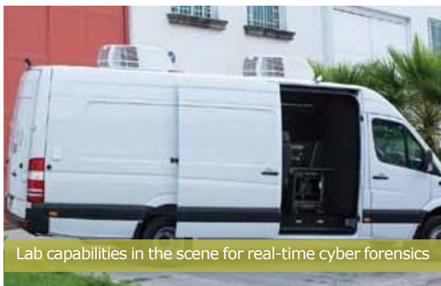
Lab capabilities in the scene for real-time cyber forensics