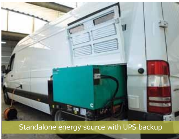
Standalone energy source with UPS backup