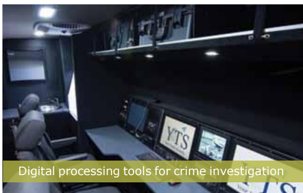
Digital processing tools for crime investigation